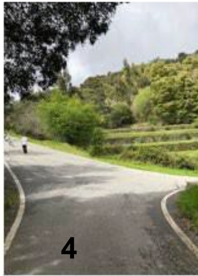
Left downhill when you get to the top of the hill Then right downhill is quicker, can go back uphill