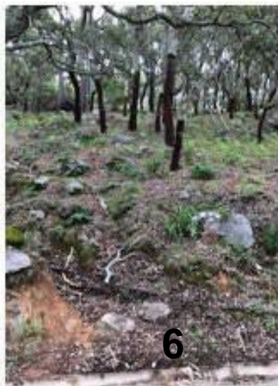
Look out for the path up to the back of the tennis court/swimming pool