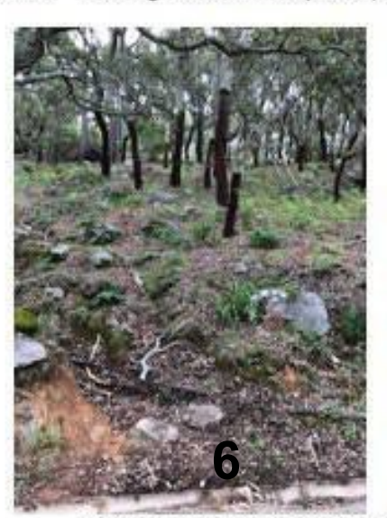
Walk up here, find the rough track