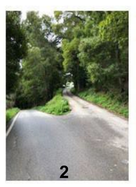
Take the path going up the hill