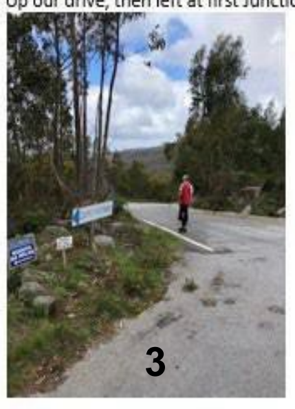
Left downhill when you get to the top of the hill Then right downhill is quicker, can go back uphill