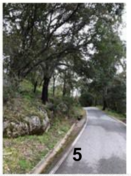
Look out for the path up to the back of